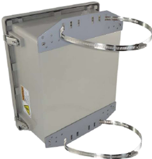
Pole Mount Configuration

The brackets can also be reversed to provide a continuous steel mounting flange along the edge of the enclosure.