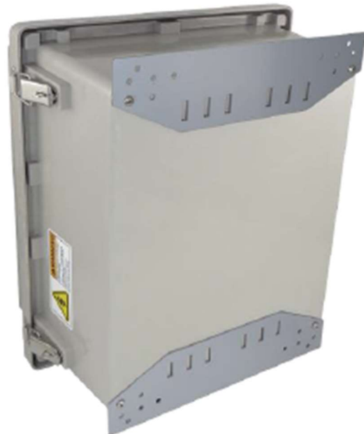
Flange Mount Configuration